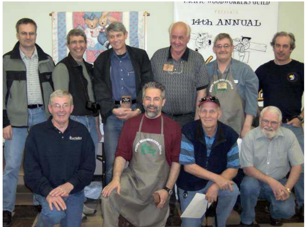
2004 2x4 Challenge Contestants