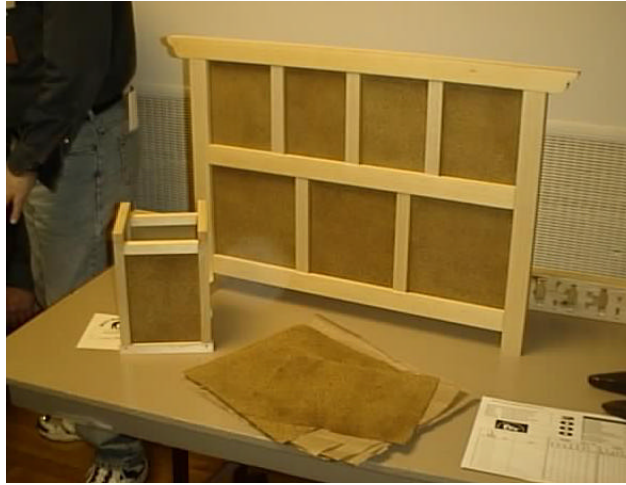
Shoji by Art Liestman.