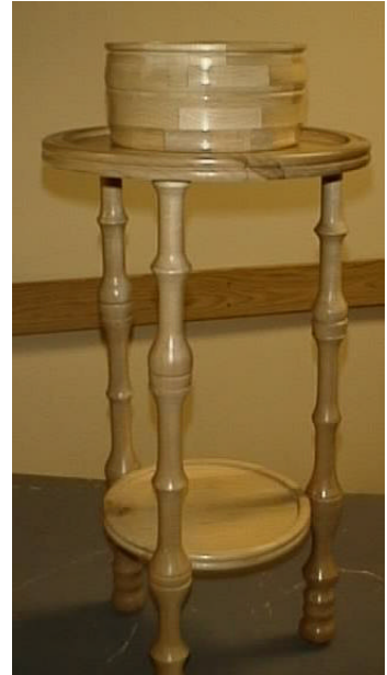
Spindle Leg Table by Fred Baldwin