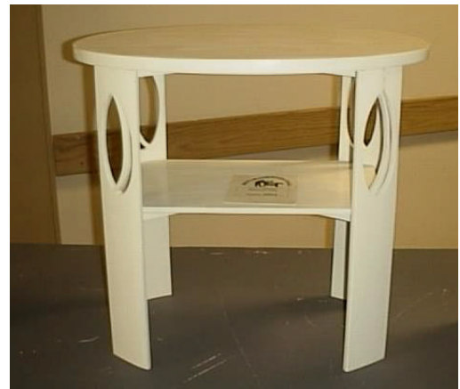
Macintosh Table by Bob Caffrey